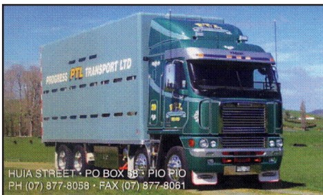
HUIA STREET • PO BOX 38 • PIOPIO PH (07) 877-8058 • FAX (07) 877-8061